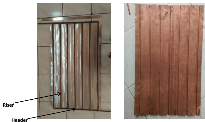
Fig. 1: The tested solar collectors with (a) aluminum absorber plate (b) copper absorber plate